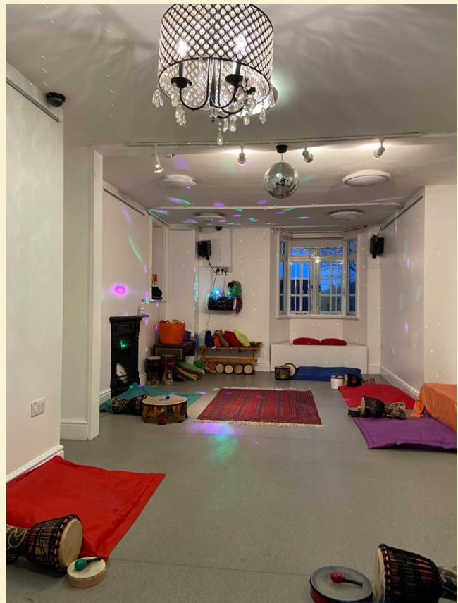
Upstairs workshop space