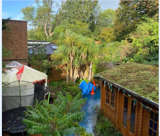
Yurt, cabin and garden space