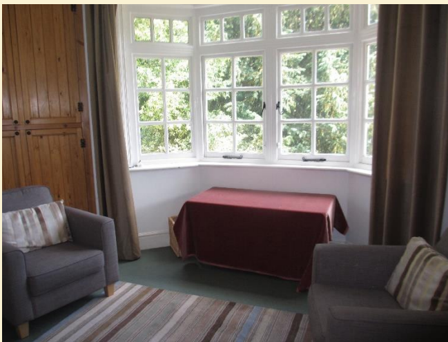
Small breakout room for parents