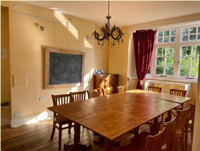
Café dining area

Café dining area, breakout room and upstairs workshop space